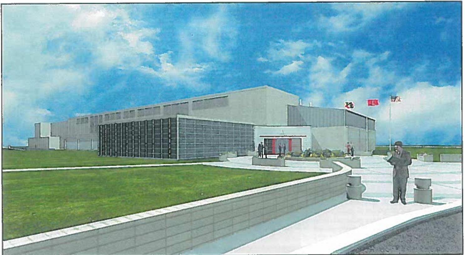
Artist's rendition of the Advanced Chemistry Lab at the Edgewood Chemical and Biological Center

Under the Chemical Weapons Convention, each signing country is allowed one single small scale facility (SSSF) for manufacturing chemical agents in small quantities for the development of defensive measures. ECBC is the United States' SSSF and this capability will be part of the ACL. The ACL will eventually be the only national source for research and development quantities of chemical agent.